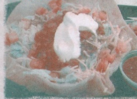
Tex Mex Taco Salad

Fresh Fruit Plate , In Season A tempting assortment of fresh seasonal fruits served with cottage cheese and raisin toast - 7.95