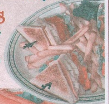
Turkey, B.L.T. Club