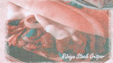
Ribeye Steak Crisper