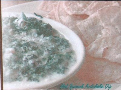
Hot Spinach Artichoke Dip