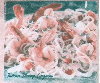
Tuscan Shrimp Linguini

A tempting platter of sliced gyros, ripe red tomato wedges, Kalamata olives and imported feta cheese. Complemented with pita and traditional tzatziki sauce - 7.95