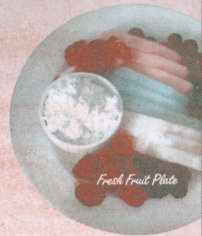
Fresh Fruit Plate

A tantalizing salad of fresh greens topped with authentic feta cheese, olives, onion, tomatoes, green peppers, cucumbers and boiled egg - 6.95 We'll be happy to add anchovies, just ask - .75 extra