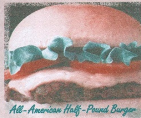
All-American Half-Pound Burger

Plain sandwiches include... a complimentary cup of today's soup, lettuce, tomato and pickle