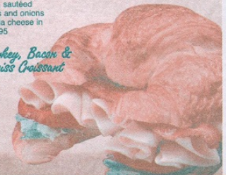
Turkey, Bacon & Swiss Croissant