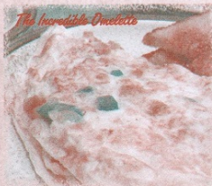
The Incredible Omelette

Western Omelette A classic omelette of ham, onions, green peppers, mushrooms and cheese - 6.75