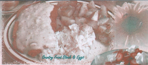
Country Fried Steak & Eggs

Steak & Eggs Skillet Tender chunks of steak, onions, green peppers, mushrooms and cheese over breakfast potatoes. Topped with two fresh eggs - 7.65