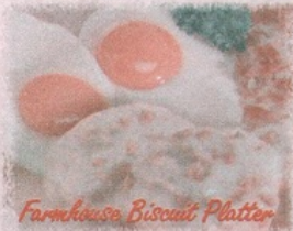
Farmhouse Biscuit Platter

A toasted English muffin split and topped with Canadian bacon, two poached eggs and our rich homemade hollandaise sauce - 7.95