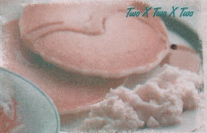
Two X Two X Two

Our Hot Off the Griddle selections are served with pure maple syrup. Lo-cal and sugar-free syrups are available