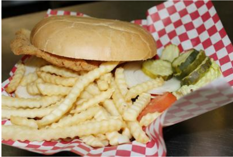
Polancic's Pork Tenderloin